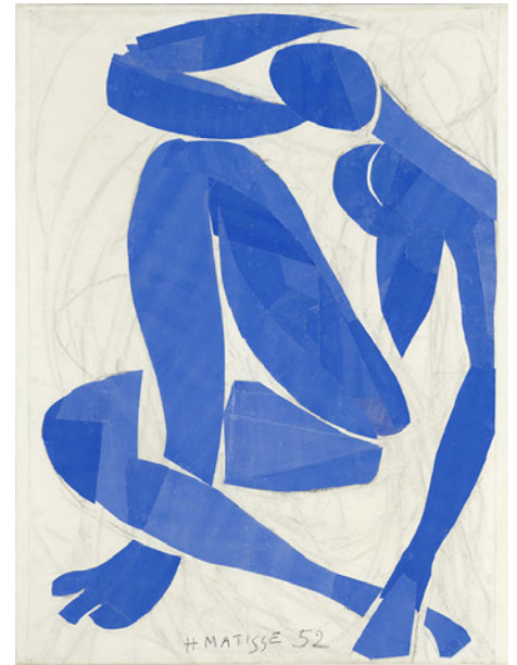
Henri Matisse, Nu bleu II, 1952

Organized by The National Art Center, Tokyo; Musée Matisse, Nice; The Yomiuri Shimbun; Nippon Television Network Corporation