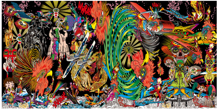
Keiichi Tanaami, The Story of Death and Rebirth, 2019

This exhibition marks the world's first major retrospective exhibition by Japanese artist, Keiichi Tanaami. The exhibition engages with the theme of “memory,” a keyword which serves to unravel Tanaami's artistic practice spanning over half a century, and attempts to uncover the entirety of his diverse oeuvre. In addition to new paintings, sculptures, and animations, the exhibition will feature valuable graphic design and illustration works created between the late 1960s and early 1970s, as well as a series of vibrantly colored wooden sculptures from the 1980s, and some of his earliest pop art works that were recently discovered in his studio.