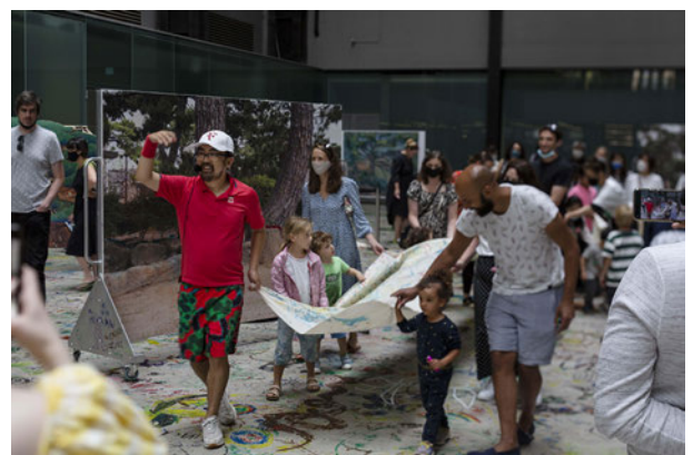
Ei Arakawa-Nash, Mega Please Draw Freely , 2021, Tate Modern, London

Recent performances/exhibitions include; Turbine Hall at Tate Modern, London (2021); Artists Space, New York (2021); Honolulu Biennial (2019); Kunstverein für die Rheinlande und Westfalen, Düsseldorf (2018); Sculpture Project Münster (2017); Museum Ludwig, Cologne (2017); The 9th Berlin Biennale (2016); Gwangju Biennial (2014); Whitney Biennial, New York (2014); Carnegie International, Pittsburgh (2013); The Museum of Modern Art, New York (2012).