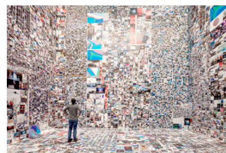
Evan Roth Since You Were Born 2023 Custom wallpaper, dimensions variable Installation View of the MOCA Jacksonville: Since You Were Born, 2019 © Evan Roth